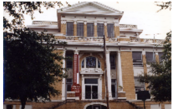
Círculo Cubano building, Tampa